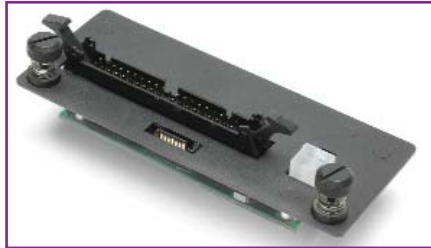
User replaceable drive stations #F-OCX-DRIVE