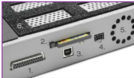
(1) Printer Port, (2) CompactFlash™, (3) USB, (4) Light stack, (5) forced air exit, (6) forced air entrance